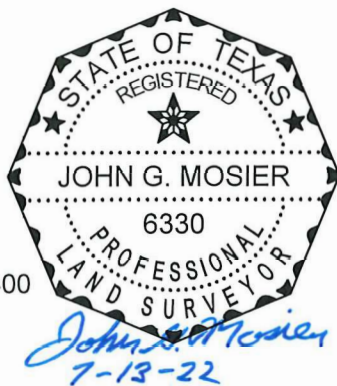
EXHIBIT OF A 5.813 ACRE TRACT PORTION OF LOT 1, BLOCK 4, N.C.B. 15671 CITY OF SAN ANTONIO BEXAR COUNTY, TEXAS

JOHN G. MOSIER REGISTERED PROFESSIONAL LAND SURVEYOR NO. 6330 10101 REUNION PLACE, SUITE 400 SAN ANTONIO, TEXAS 78216 PH. 210-541-9166 greg.mosier@kimley-horn.com